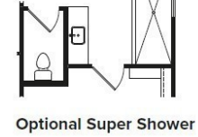
Optional Super Shower