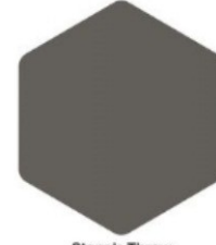
Stone's Throw PPG1008-7

(Reference specific home selections for applicable items and specific material locations.)