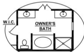
OPTIONAL GLAMOUR OWNER'S BATH