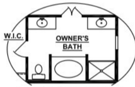
OPTIONAL GLAMOUR OWNER'S BATH