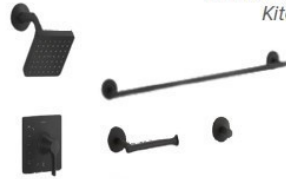
Bath Hardware Kohler - Black