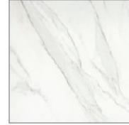
Emser Nobleza - Lugo 12"x12" - Straight Set Walls - Polished / Floors - Matte Prism #381 Bright White