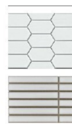
Emser Omni - White 10"x12" Mosaic Prism #381 Bright White