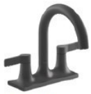
Bathrooms Kohler - Black