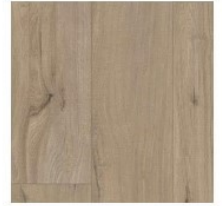
Floating Shaw Elkview Crossing Driftwood