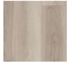
Floating Shaw Elkview Crossing Lighthouse