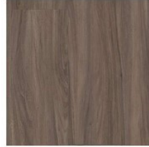
Floating Shaw Elkview Crossing Cinnamon Walnut