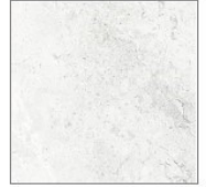
Owner's Bath Only Emser Culver - White 13"x13" Straight Set Prism #381 Bright White