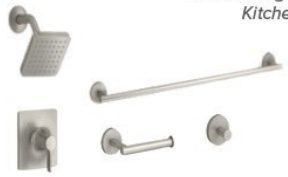
Bath Hardware Kohler - Brushed Nickel