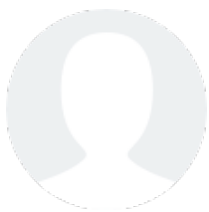
Elisa Cohoon Century Communities

Canebrake at Hickory Hills is a brand new community in Old Hickory, tucked away in the well-established Hickory Hills neighborhood. Pre-sales are currently active. Planned amenities include a pool, playground, walking trails, and more. Centralized community location with a short commute to Downtown Nashville, BNA Airport is 10 miles away, Providence Marketplace, Long Hunter State [...]