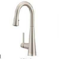
Kitchen Kohler - Brushed Nickel