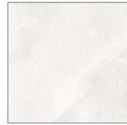
Owner's Bath Only Emser Vernon - White 13"x13" - Straight Set Prism #545 Bleached Wood