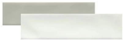
Emser Craft II - 3"x12" Straight Set White w/ Greyhound & Stone Gray Cabinets Prism #381 Bright White Fawn Glossy w/ White Cabinets Prism #386 Oyster Gray