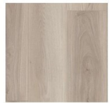
Floating Shaw Elkview Crossing Lighthouse