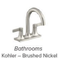
Bathrooms Kohler - Brushed Nickel